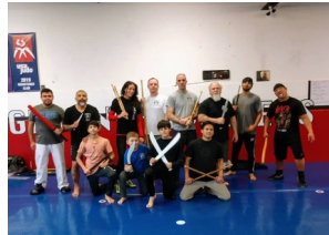
HSFA 1st Quarter Gathering was held at Ground Dwellers in Spring, TX