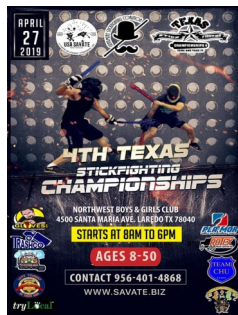
Texas Stick Fighting Championships