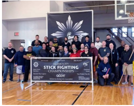
Alamo City Stick Fighting Championships