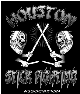
HSFA 2nd Quarter Gathering of 2019 Saturday, June 22th 12-2 pm at Gracie Barra Westchase in Houston, TX.