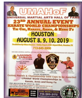
Stick Fighting Tournament at the Universal Martial Arts Hall of Fame